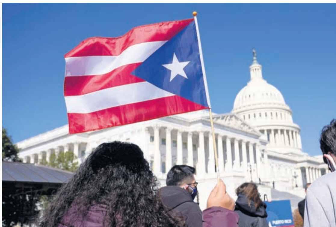
A woman waves the flag of Puerto Rico during a news conference on Puerto Rican statehood on Capitol Hill in Washington, March 2, 2021.

"It is crucial to me that any proposal in Congress to decolonize Puerto Rico be informed and led by Puerto Ricans," said Rep. Raúl Grijalva, D-Ariz., chairman of the House Natural Resources Committee, which oversees affairs in U.S. territories. The proposal would commit Congress to accept Puerto Rico into the United States as the 51st state if voters on the island approved it. Voters also could choose outright independence or independence with free association, whose terms would be defined following